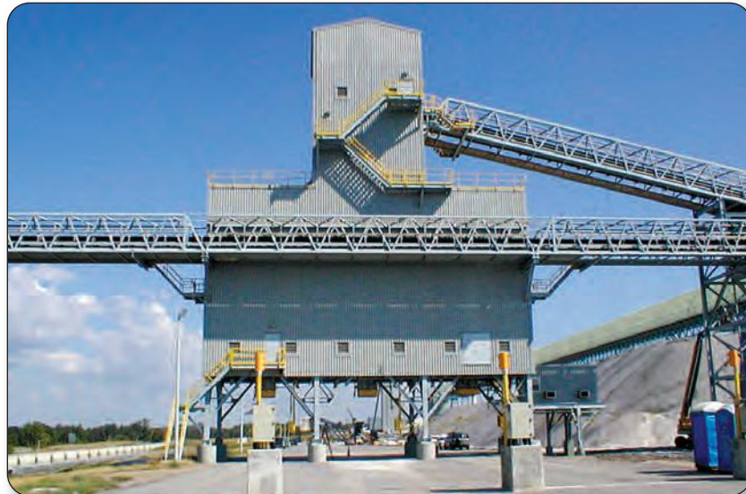
Triple bay truck loadout system

Building Relationships. Creating Solutions.